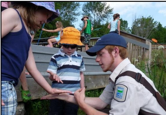
Students will have the opportunity for hands-on discovery

The Kids 'n Nature program has been developed and funded by the Friends of Presqu'île Park, in cooperation with Presqu'île Provincial Park.