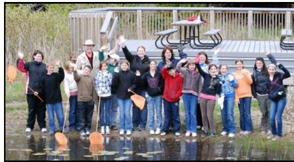
The first Kids 'n Nature class in 2010, Grade 6 from Brighton Public School

If you were here last year with your students, come back, as the choice is twice as broad!